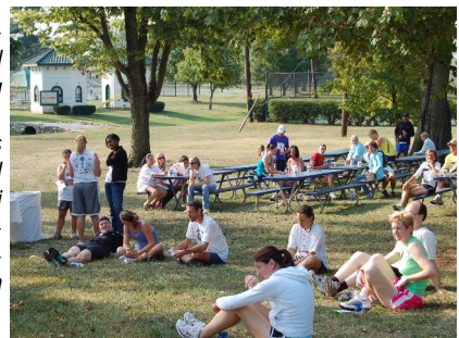
Photo to right: runners cool down and refresh while waiting on the run results. Some of the foods provided by Tropical Smoothie Café, Pepsi Cola Bottling Co, Papania's Inc, and students from Sullivan University.

More photos are available online; you can see them at www.lexingtoncasa.com . Photos on this page and the website courtesy of Joe Schuler.